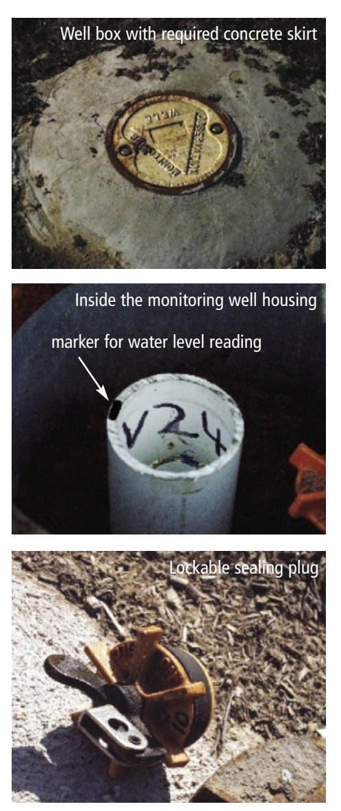
Figure 3. Well box, access pipe with water level measurement mark, and lockable plug of a monitoring well.

Access to production wells can be more difficult. Ideally, a sample valve or spigot will be located in the water pipeline between the wellhead and the water storage or pressure tank. In many domestic wells, however, the closest access to water from the well is at the exit point of the water pressure tank or at a water faucet inside the house. When testing ground water, the water sample ideally should not be collected from the tap. If the house is on a water treatment or water softening system, either of which involves chemical alteration of the water, the sample should be taken at a point in the distribution system that comes before the water enters any treatment and as close to the well as possible. If you can only draw a sample at the outflow of a pressure or storage tank, you should flush the tank prior to sampling (see below).